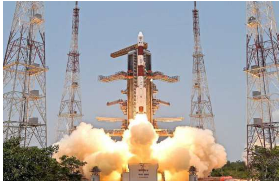
GAZING SKYWARD. The Centre has allowed 100 per cent overseas investment in manufacturing of components for satellites

By changing the current policy, the government has allowed up to 74 per cent